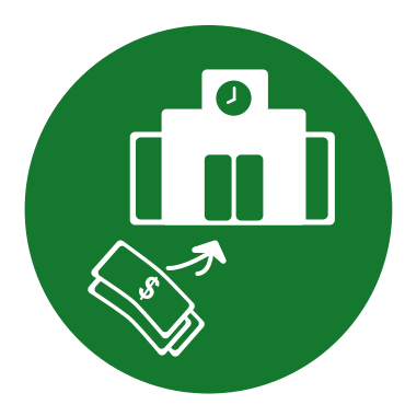
Parents make their payment to an eligible school for an exceptional needs student's tuition.

Parents or guardians of exceptional needs students attending eligible schools can apply for a refundable Parental Tax Credit toward their South Carolina income tax bill. Parental Tax Credits can only be claimed for actual out-of-pocket spending on tuition, up to $11,000. There is a statewide cap of $2 million in credits for tax year 2020, reserved on a first come, first served basis.