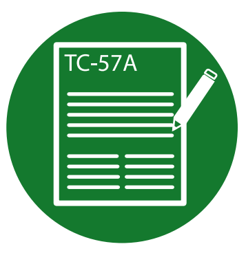
Parents complete and submit Form TC-57A to the SCDOR to request a Parental Tax Credit. Parents should retain documentation of their child's eligibility for their own records.