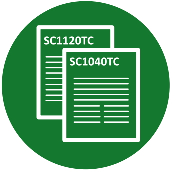
Donors claim the credit amount with their SC income taxes using SC1040TC or SC1120TC (code 057).